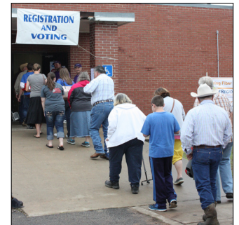
File photo from 2016 Annual Meeting

Under LREC's Bylaws, each year the Cooperative holds an annual meeting the last Saturday in April. This year's meeting is scheduled for April 28th. At the annual meeting, LREC members can meet with the board of trustees and co-op staff and receive an update regarding the Cooperative's activities during the past year. The meeting also brings the annual election of board members, which represents you, the members of the co-op. Members can cast their ballots at the meeting; enjoy a free meal and visit with other members of the cooperative.